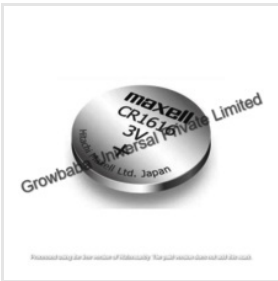
Maxell CR1616 3volt Lithium Coin Cell