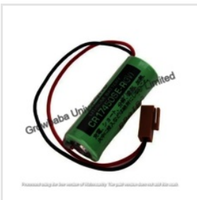
Sanyo CR17450SER(3V) 3volt Li-MnO2 Battery