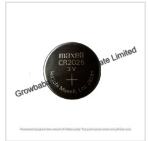
Maxell CR2025 3volt Lithium Coin Cell