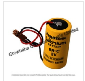
Panasonic BRC 3volt Lithium Battery