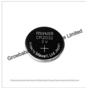
Maxell CR2032 3volt Lithium Coin Cell