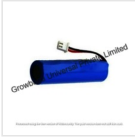
18650 Lithium-Ion Battery For Led Bulb