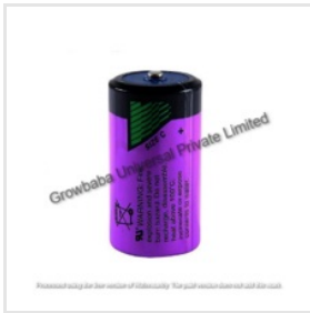
Tadiran TL5920 3.6volt Size: C Li-SOCL2