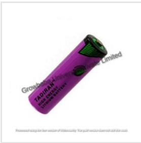
Tadiran TL5903 3.6volt Size: AA Li-SOCL2