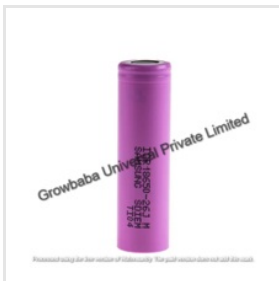
Samsung ICR18650-26J 3.6volt 2600 MAH