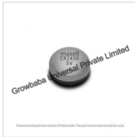
Maxell CR2450 3volt Lithium Coin Cell