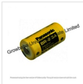
Panasonic BR2/3A 3volt Lithium Battery