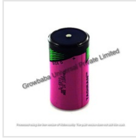
Tadiran TL5930 3.6volt Size: D Li-SOCL2