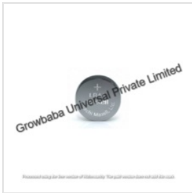
Maxell LR44 1.5volt Coin Cell Battery