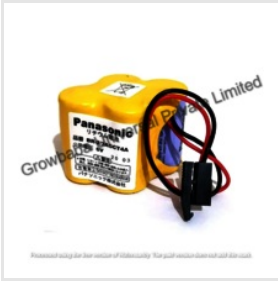
CNC And PLC Machine Batteries