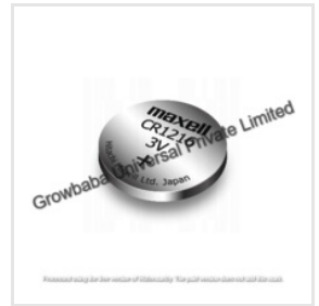
Maxell CR1216 3volt Lithium Coin Cell