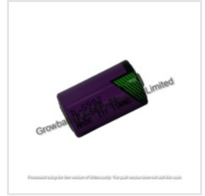
Tadiran TL5902 3.6volt Size: 1/2AA Li-SOCL2