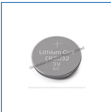
LITHIUM COIN CELL BATTERY

1 2volt AA Rechargeable Battery, 1 2volt AAA Rechargeable Battery, 11.1volt 2600mah Li-ion Rechargeable Battery Pack, 12.8volt 12ah LiFePo4 Rechargeable Battery Pack, 12.8volt 6ah LiFePo4 Rechargeable Battery Pack, 14.8volt 2600mah Li-ion Rechargeable Battery Pack, 18650 Lithium-Ion Battery for Led Bulb Capacity 2000mah, 18650 Lithium-Ion Battery for Led Bulb Capacity 2200mah, etc.