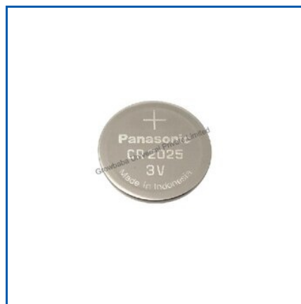
COIN CELL BATTERY